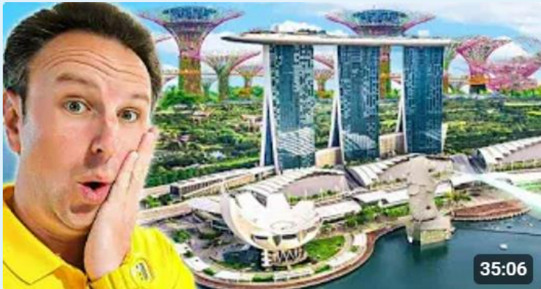
SINGAPORE TRAVEL GUIDE: Everything You Need to Know