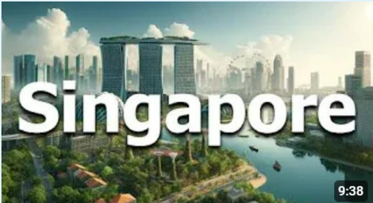
Singapore 2024 - Full Travel Guide