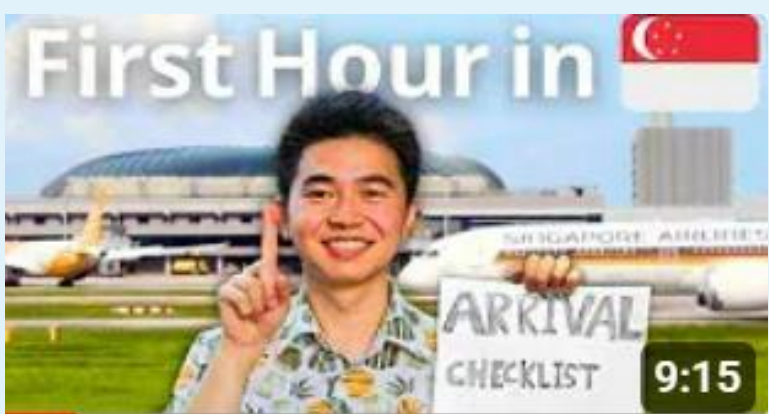
Your FIRST HOUR in Singapore - 2024 Travel Guide